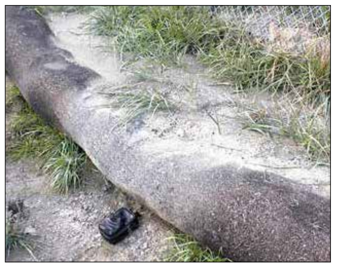
"Our Soxx™ Don't Fall Down": Accumulated sediment doesn't release; no mass failure

procedures used for the Water Erosion Prediction Project (WEPP) developed by the USDA National Soil Erosion Research Lab. Total suspended solids were determined following methodology outlined by the US EPA.