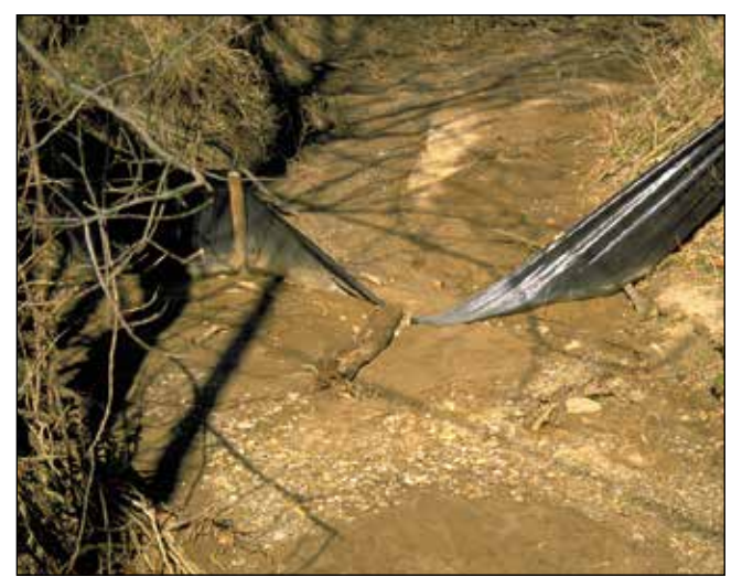
Silt Fence Failure: Accumulated sediment released in a mass failure

Nine sediment control barriers were installed across the entire base-width of individual test plots. The control (bare soil) received no sediment control barrier. All treatments and the control were replicated in triplicate for a total of 30 test plots. Runoff sampling procedures and calculation methods followed